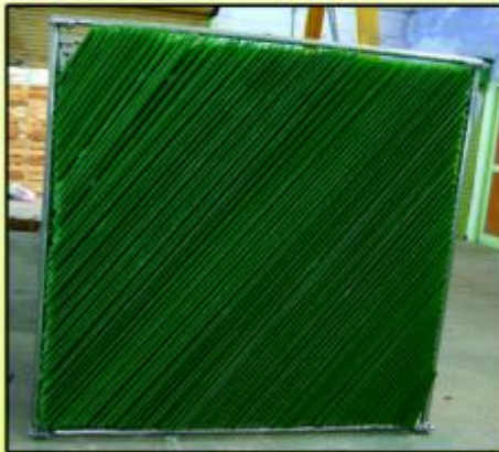
Coalescing plate interceptor pack

Standard Capacity : 100 LPH to 250 m3/hr (Higher capacity can be designed on request.)