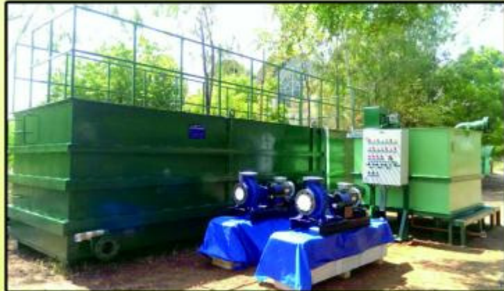
Oil water separator