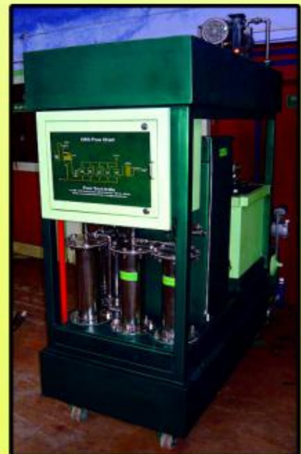
Metal working fluid recovery system