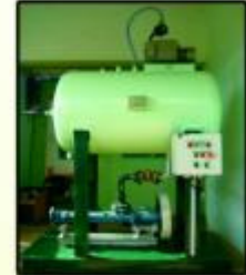
Fatty oil skimmer