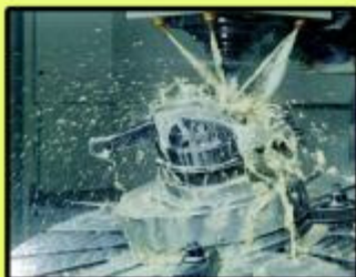
Metal working fluid in Operation