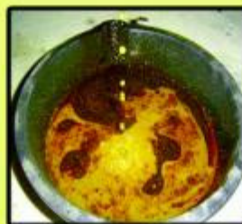
Used metal working fluid